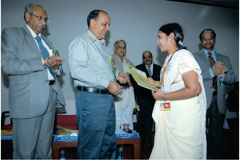
A Learner receiving Gold Medal from Chief Guest at 2 nd Graduation Ceremony