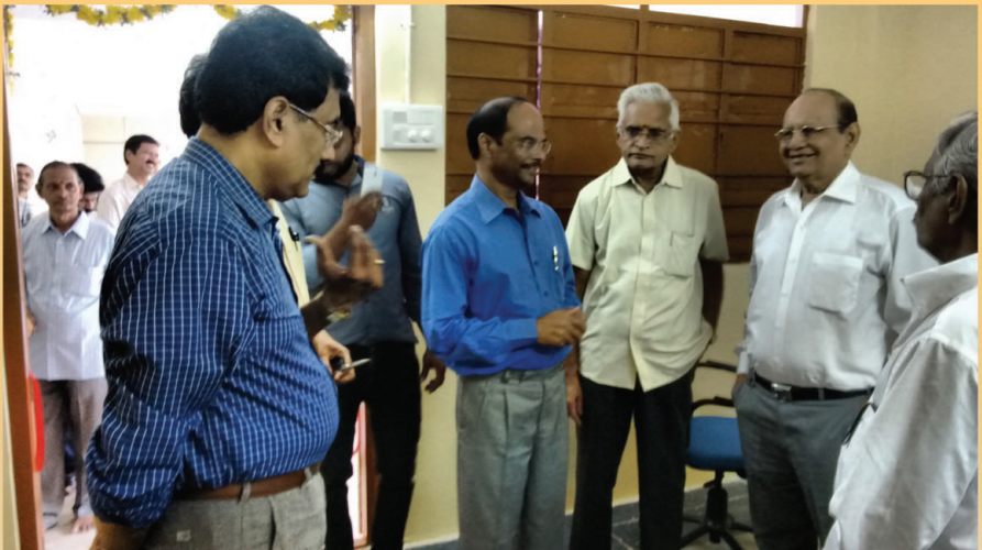
Inauguration of Regional Information Centre at Vijayawada