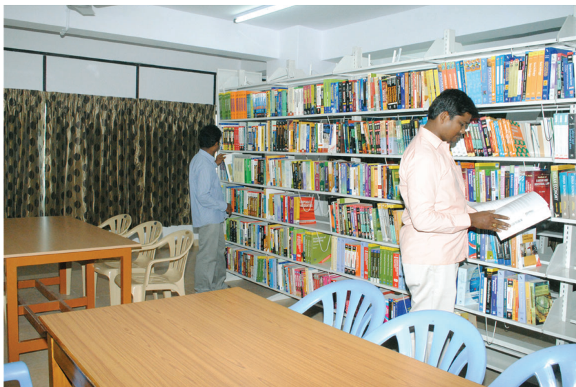
Learning Resources Centre

Admission to the programme shall be made on the basis of pass obtained in GAT subject to the fulfillment of the eligibility criteria.