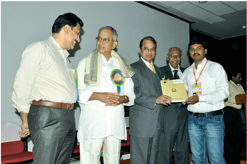
3 rd Graduation Ceremony