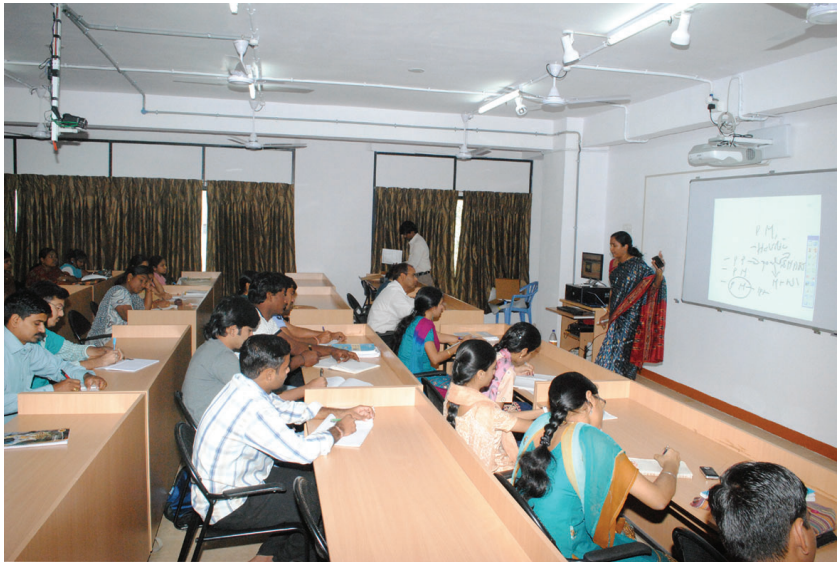
Teaching - Learning Process - Virtual Class Room